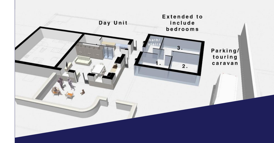
Figure 6: Day unit study, indicating where required fire safety offset distance is utilised to allow future expansion of the day house to provide sleeping accommodation.