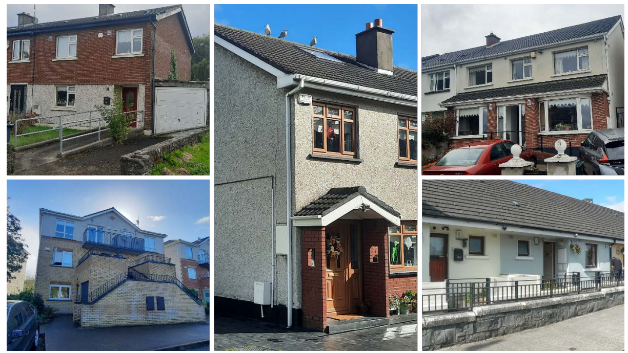
Figure 3 – Collage of Case Studies 1 to 5