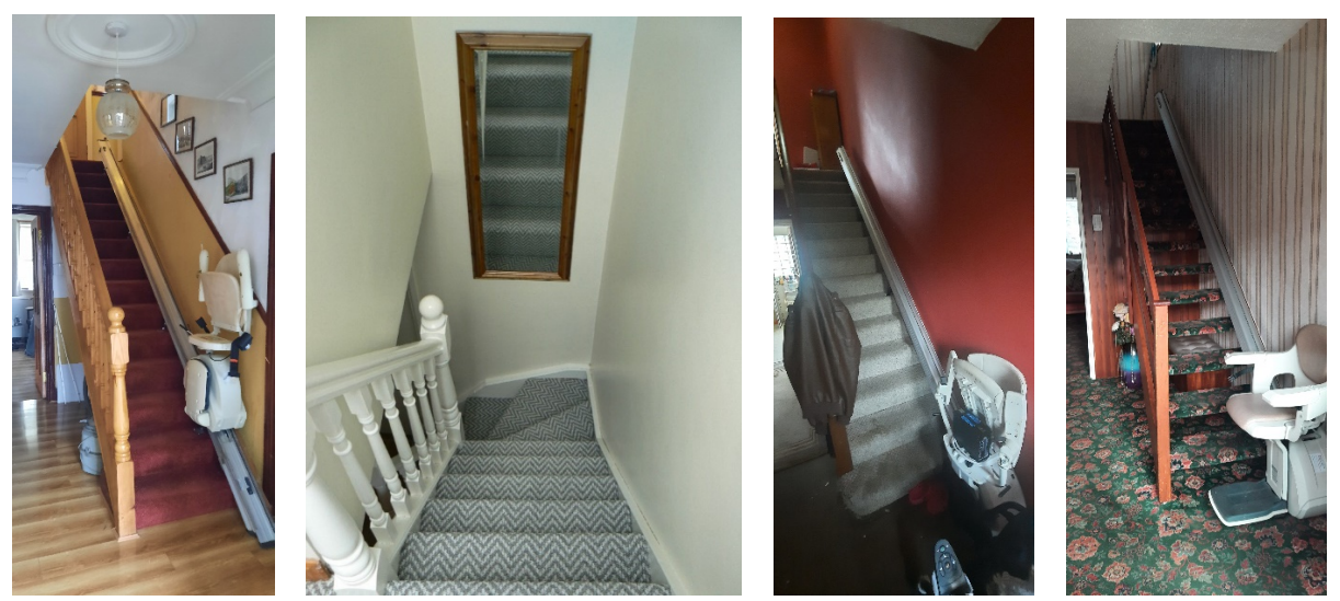
Figure 7 - Most of the case studies were two storeys with stairs.

occupants with mobility issues, living in homes with 2 or more storeys, were still sleeping upstairs. Similarly, many of these homes did not have a ground floor WC. As a result, occupants were forced to use the stairs, or a stair lift to access their bedrooms or the bathroom during the day. This increased their risk of falls on stairs.