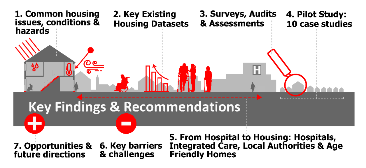
Figure 1 - Key themes – Findings and Recommendations

This project was solely focused on housing for older people, particularly those who are patients of TUH's Integrated Care Programme for Older Persons (ICPOP). However, where relevant the recommendations refer to a) a general housing conditions survey; b) a housing survey for older people; and c) the housing conditions for ICPOP patients (with relevance for Tallaght and the wider country).