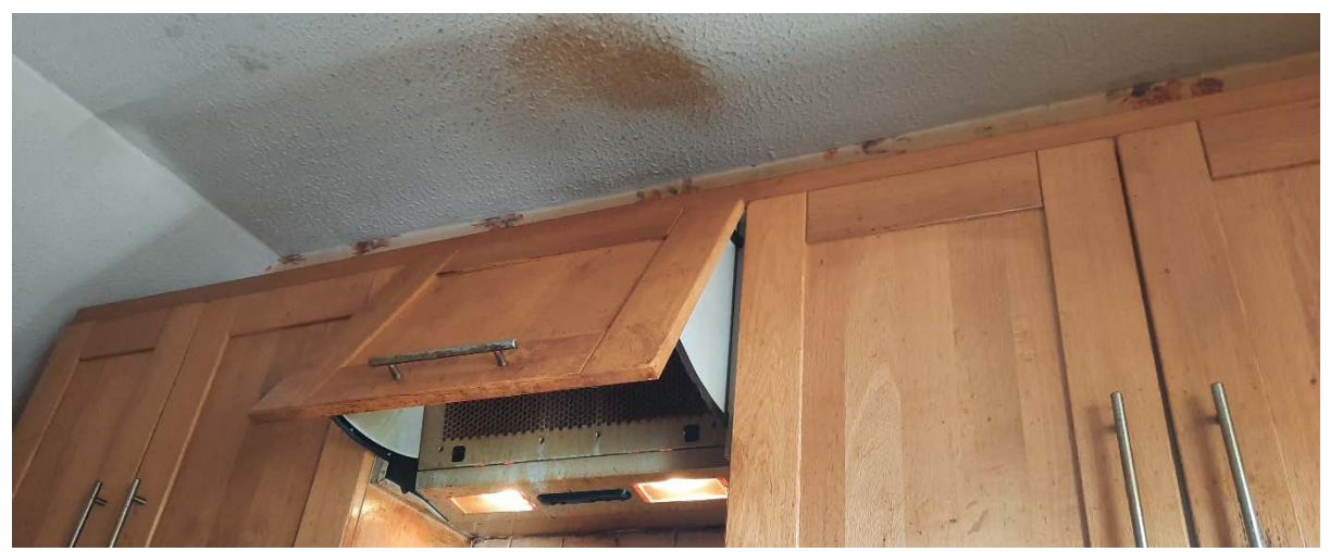
Figure 5 - Damp and mould growth from an extractor fan without a duct to outside.

some difficulties ventilating an upstairs bedroom being utilised as a laundry room, causing condensation possibly leading to mould growth. However, the household was aware of this hazard and managing it. A poorly fitted kitchen extract fan was recorded in one case study and this leading to damp and mould growth within the kitchen.