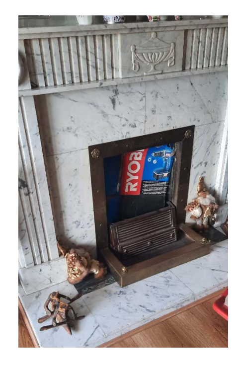
Figure 6- Open fireplaces.

Excessive Heat: (100% - Average for age and type)