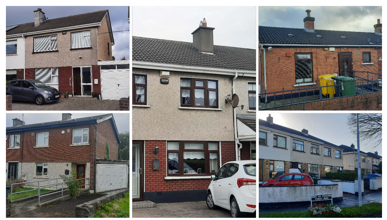
Figure 4 – Collage of Case Studies 6 to 10