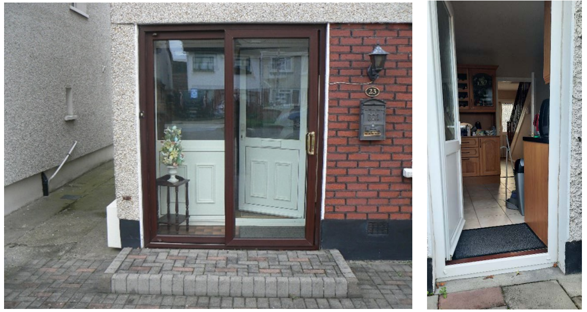
Figure 8 - Stepped access at both front and rear entrances

Falls associated with baths etc.: (70% – Significantly better than average / 30% - average for age and type)